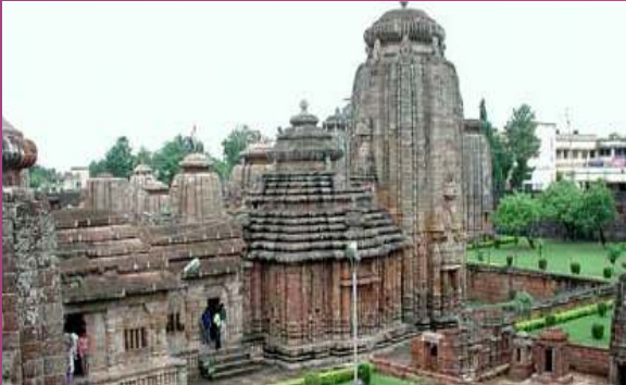
East India Golden Triangle

The eastern region of India, though does not see many visitors in the form of tourists, but is extremely beautiful. This 5 nights and 6 days East India Golden Triangle tour cover Bhubaneswar, Konark and Puri. These 3 places have a lot of religious importance. You will get a chance to visit some of the most well-known temples of these places such as Konark Sun Temple, Lingraj Temple and so on.