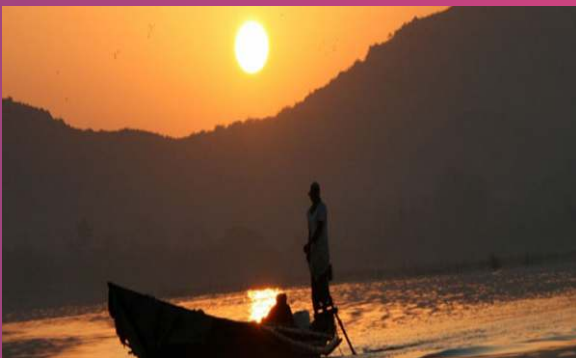
Bhubaneswar Adventure Tour

Nandankanan Zoological Park is a 400-hectare zoo and botanical garden in Bhubaneswar, Odisha, India. Established in 1960, it was opened to the public in 1979 and became the first zoo in India to join World Association of Zoos and Aquariums in 2009.