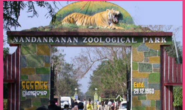
Day Excursion to Nandankanan

The eastern region of India, though does not see many visitors in the form of tourists, but is extremely beautiful. This 5 nights and 6 days East India Golden Triangle tour cover Bhubaneswar, Konark and Puri. These 3 places have a lot of religious importance. You will get a chance to visit some of the most well-known temples of these places such as Konark Sun Temple, Lingraj Temple and so on.